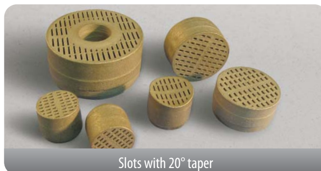
Slots with 20° taper

Super self-cleaning vents made in Manganese Brass and represents the technological evolution of screen vents.